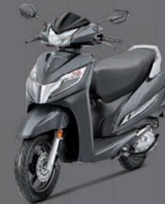
HEAVY GRAY METALLIC