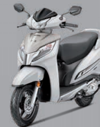
PEARL PRECIOUS WHITE WITH SALEN SILVER METALLIC