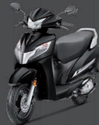
PEARL NIGHT STAR BLACK