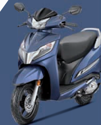
MIDNIGHT BLUE METALLIC